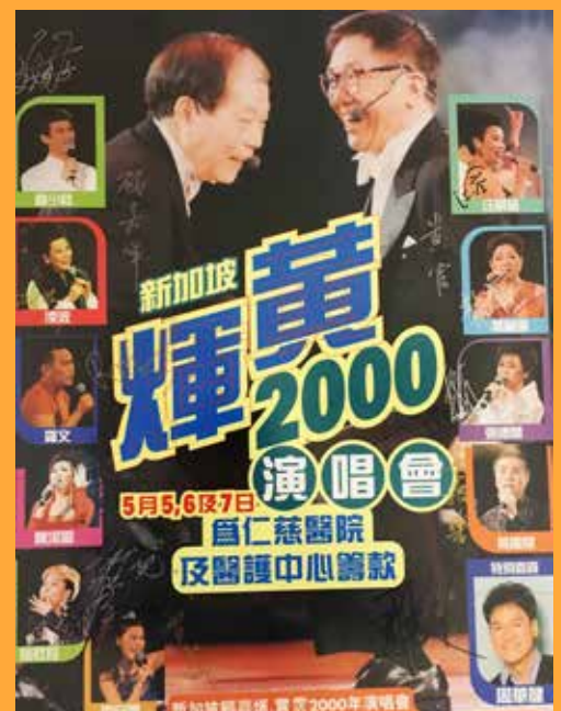
* Ren Ci Charity Concert 2000 Poster

For pre-booking of seats or enquiries on donation tickets and sponsorship, please contact Karen Tan at 6355 6428. These donations will be entitled to 250% tax deduction. Ticket sales will be released to public from March 2017 at all SISTIC channels.