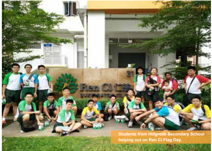
Students from Hillgrove Secondary School helping out on Ren Ci Flag Day.

The island-wide street collection raised over $54,000 to support patient care across Ren Ci's facilities. Thank you to all our volunteers for your time, and to our supporters for your contributions!