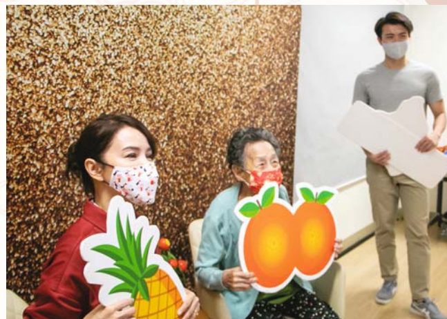
Mediacorp celebrities with our client for a photo session