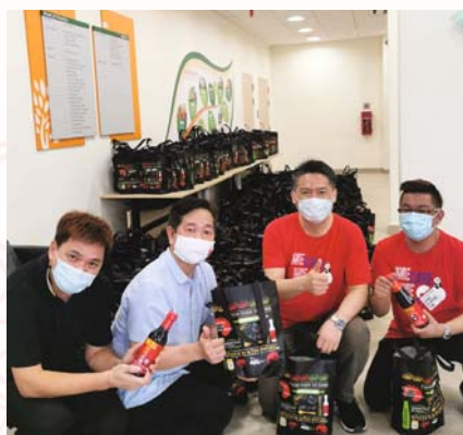
Master Chefs visiting Ren Ci @ Ang Mo Kio