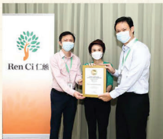
西南区市长刘燕玲颁发2020年社区精神奖