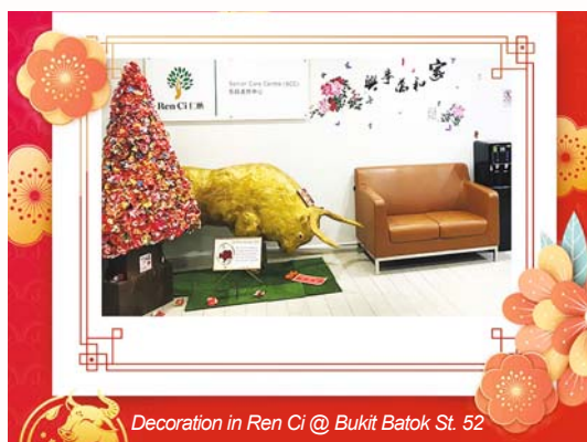
Decoration in Ren Ci @ Bukit Batok St. 52